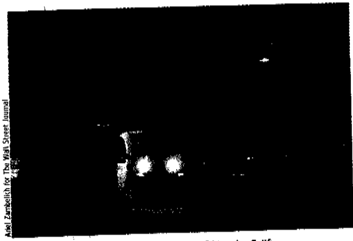
A Think electric car cruises the streets of Lincoln, Calif.

The vehicles have been common for many years in gated communities and resorts, but more recently have begun appearing on public roads, where they have to share the pavement