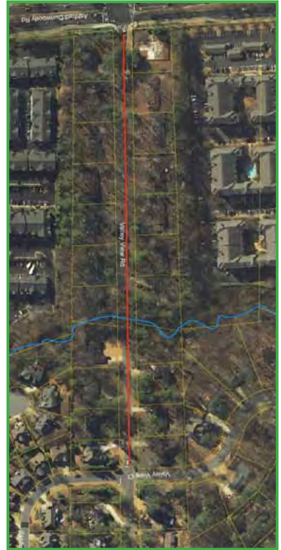
Valley View Road