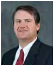
Ken Wright Mayor