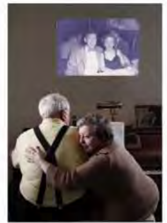
REMEMBERED: PHOTOGRAPHS BY GREGG SEGAL

The Spruill Garden Project includes a vegetable garden created by master gardeners; all harvested food is being donated to food banks. There is also a sculpture garden on display.