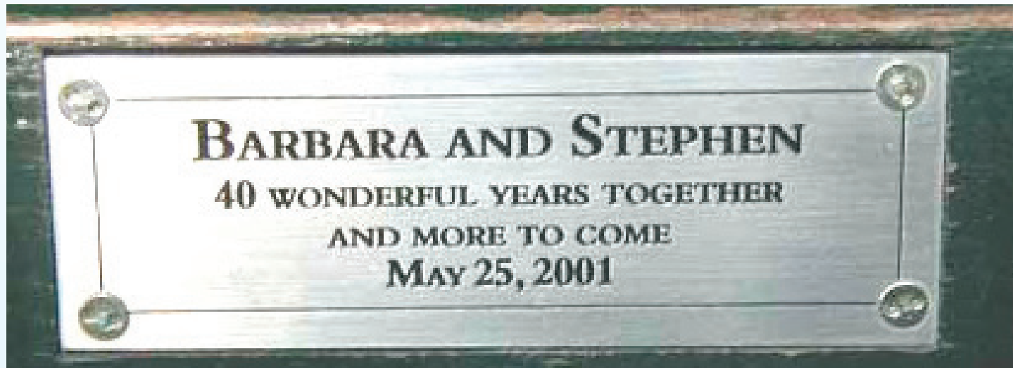
Example of plaque message. From Central Park, NY, NY.