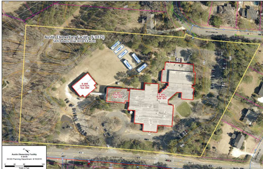
Image below shows area to be acquired pending legal description

Legal Description of Existing Austin E.S. Property (9.8 +/- acres to be acquired by the City)