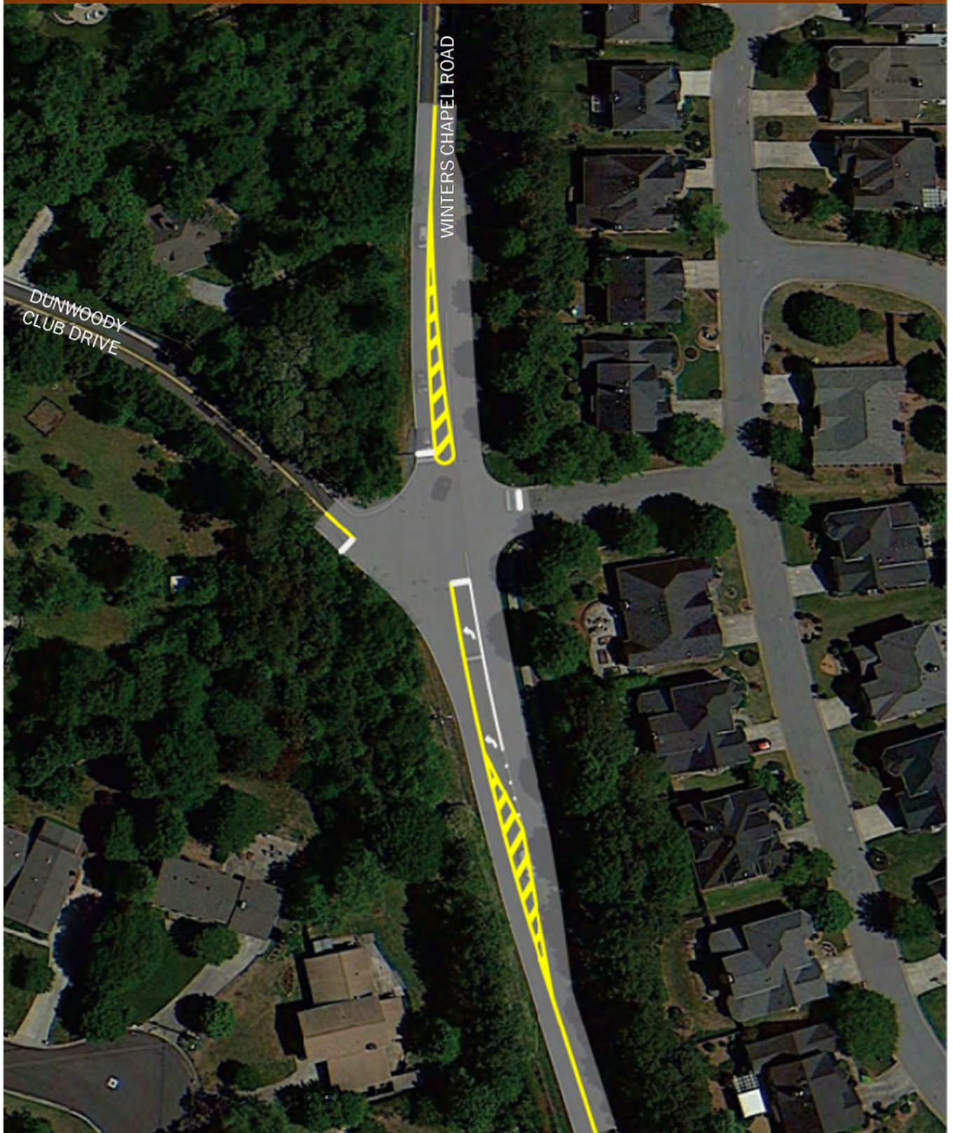
FIGURE 7 ST-1: RE-STRIPE DUNWOODY CLUB DRIVE AND MODIFY SIGNAL