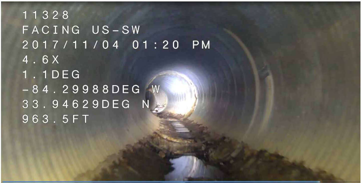
Deteriorated portions of 36" Corrugated Metal Pipe