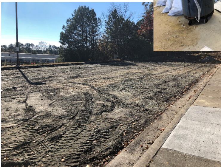
Parking lot in process of receiving new pavement