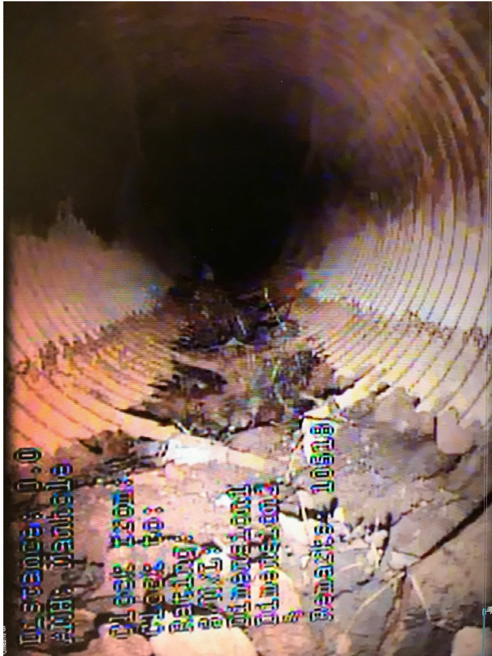
Deteriorated portions of 24" Corrugated Metal Pipe