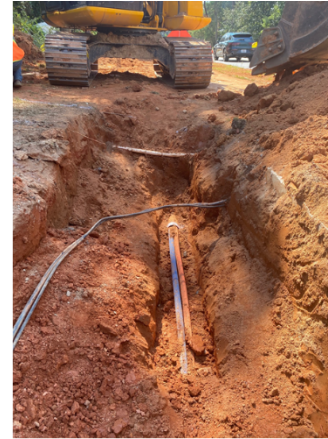
Spalding Drive Utilities