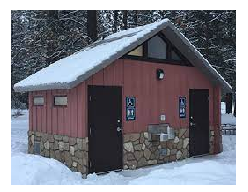
CXT Denali Example.