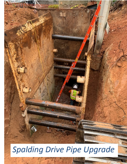
Spalding Drive Pipe Upgrade