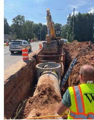
Winters Chapel Storm Pipe Installation