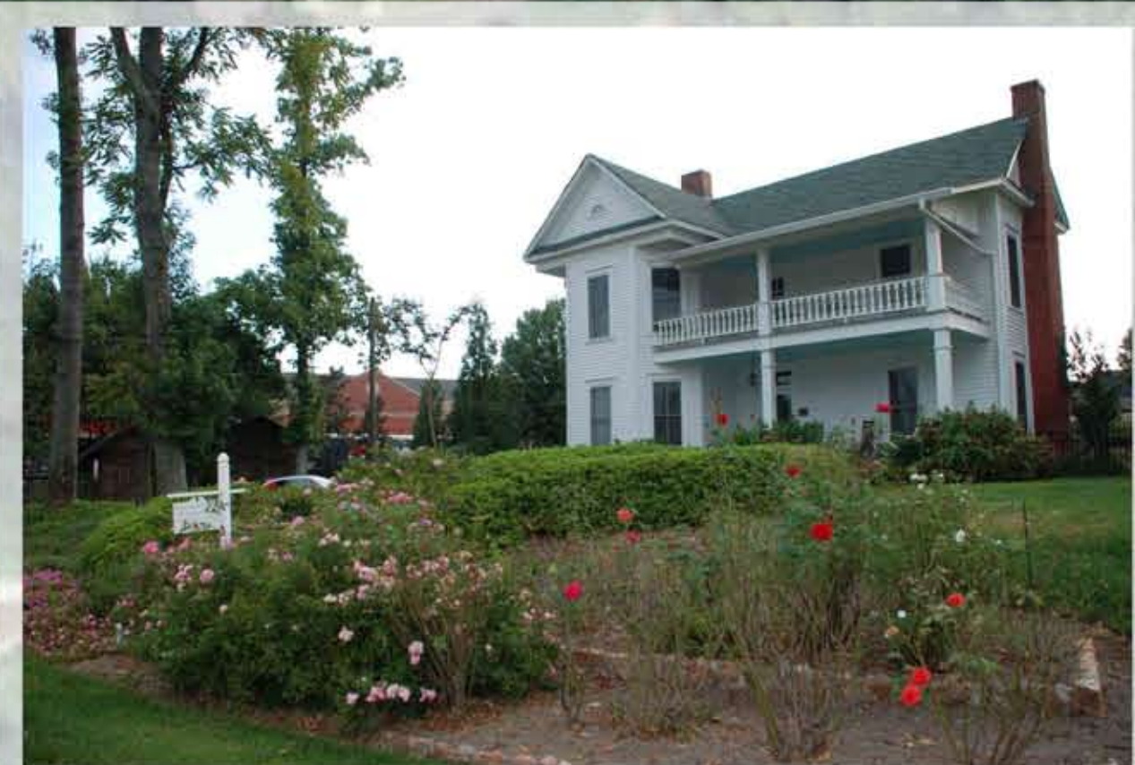
THE FARM HOUSE