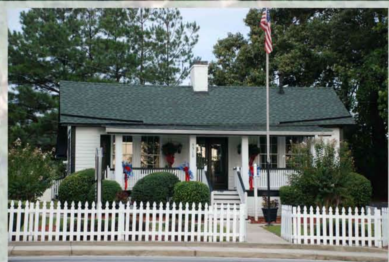
THE CHAMBER OF COMMERCE