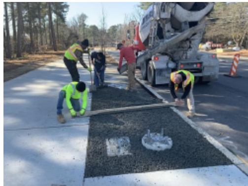
Georgetown Gateway Bus Stop Shelter Pad