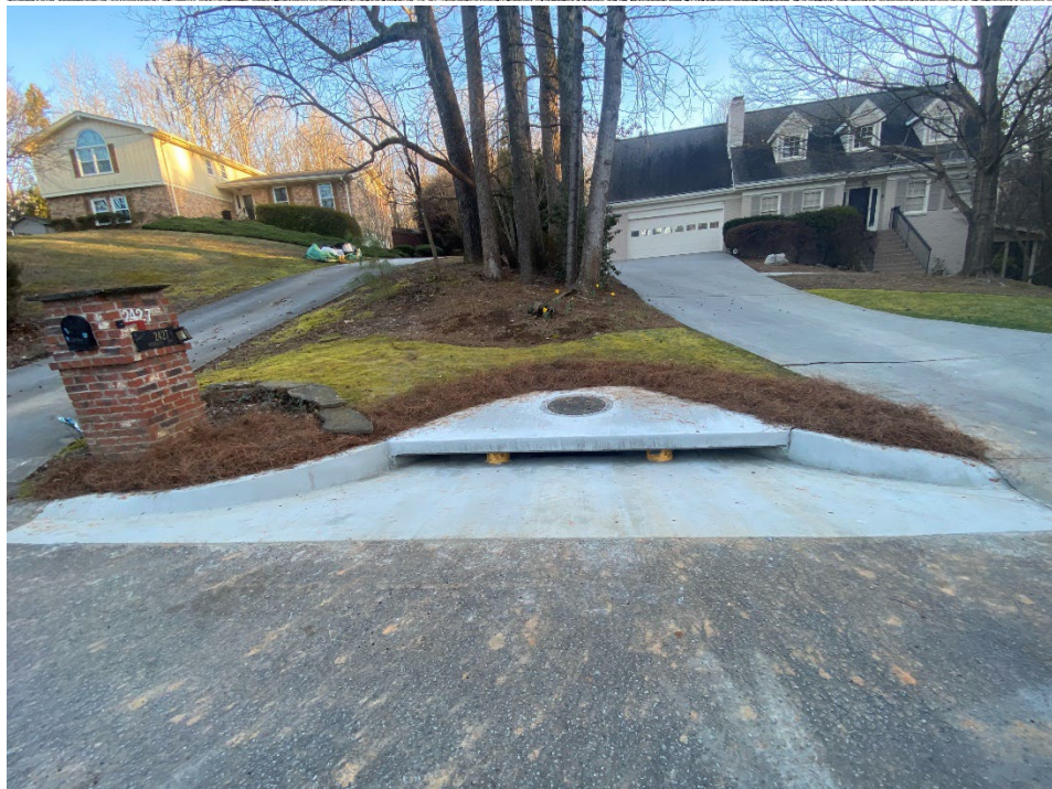
Catch basin top slab, throat, and curb repairs