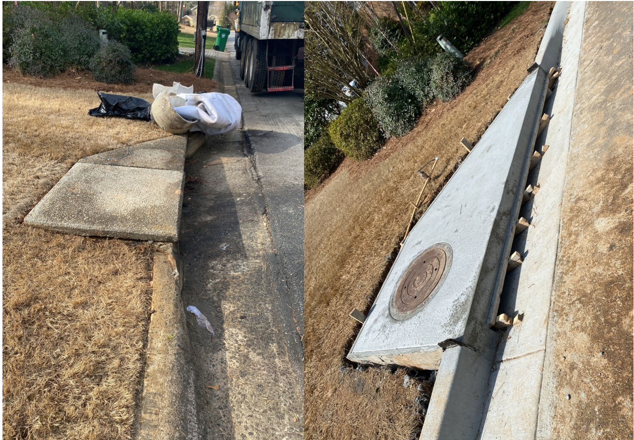
Catch basin top slab, throat, and curb repairs