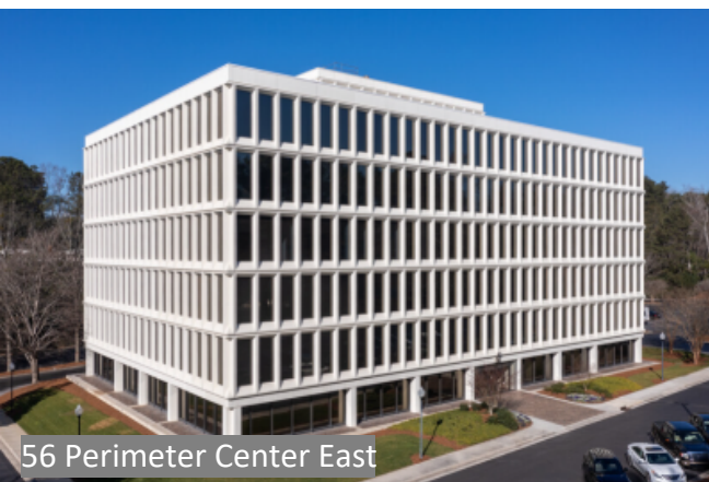
56 Perimeter Center East