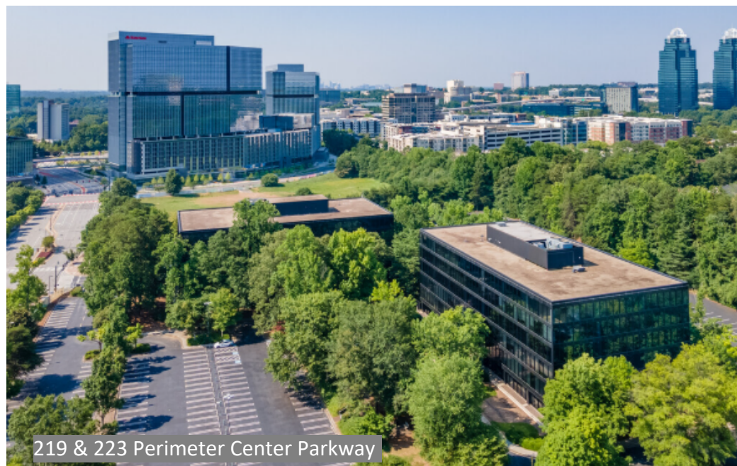
219 & 223 Perimeter Center Parkway