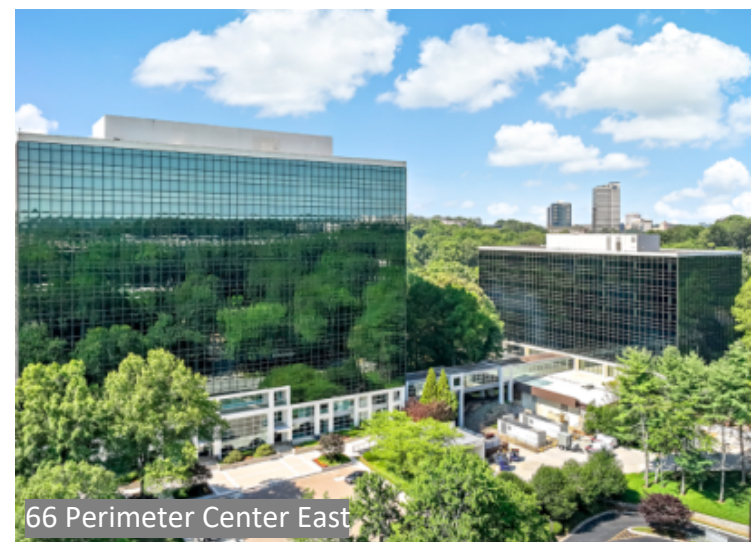
66 Perimeter Center East