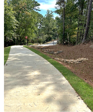
Cherry Hill Path