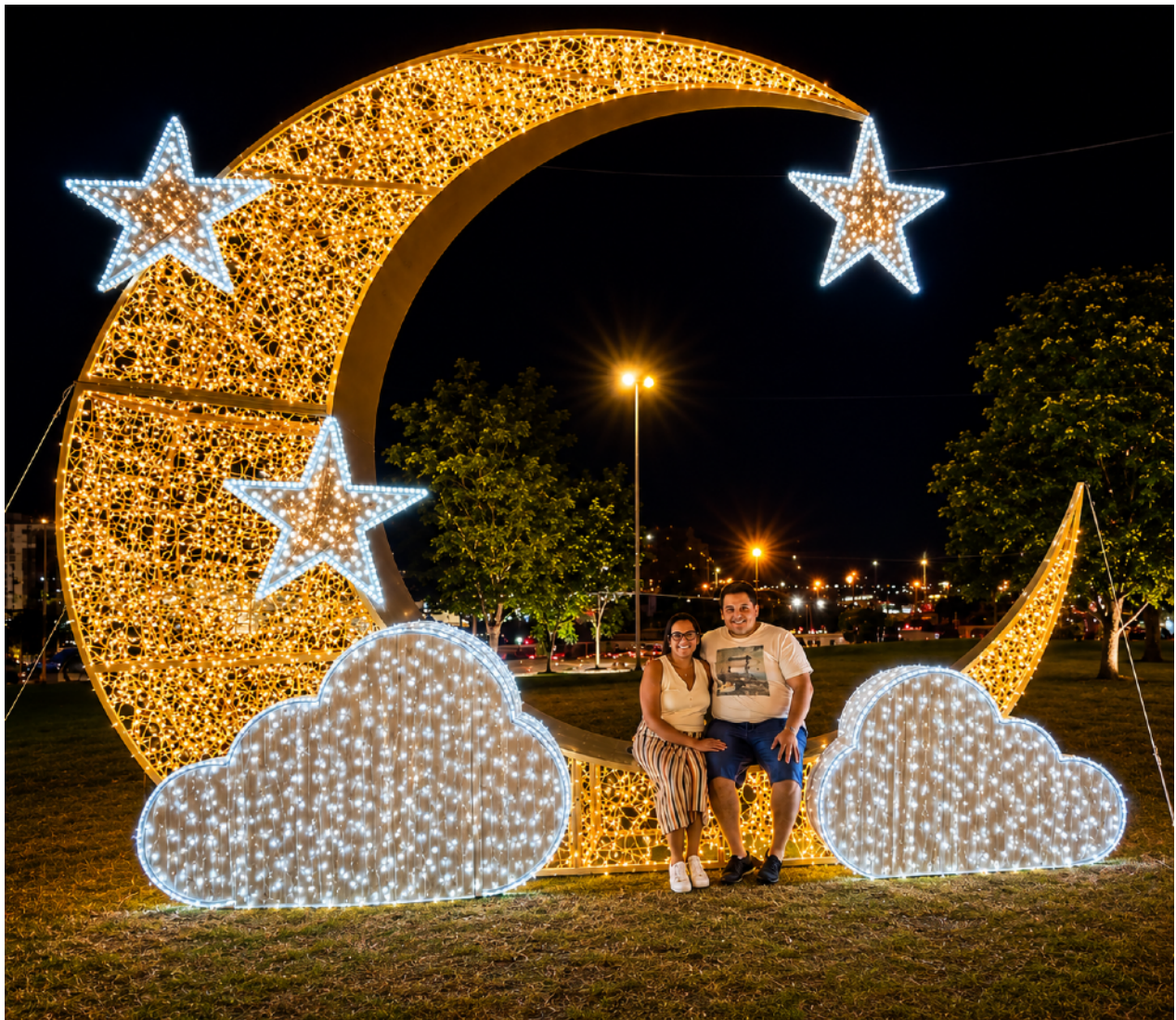
Example of Moon Photo Opportunity

Standing approximately 12 feet tall, the moon serves as an inviting walk-in photo opportunity where guests can step inside and capture memorable moments beneath the glowing stars. Warm white illumination gives the installation a soft, magical appearance, while the oversized scale creates a striking focal point that appeals to visitors of all ages.