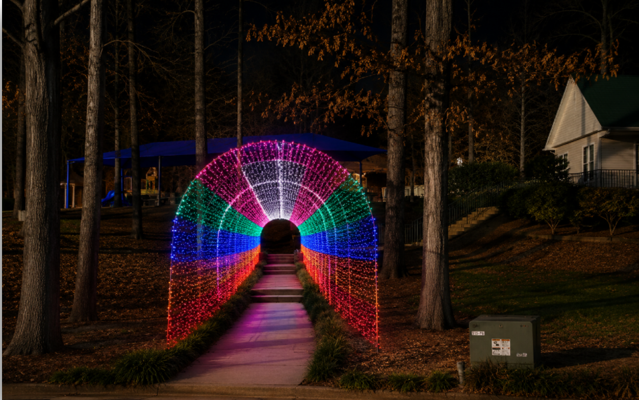
Example of Light Tunnel