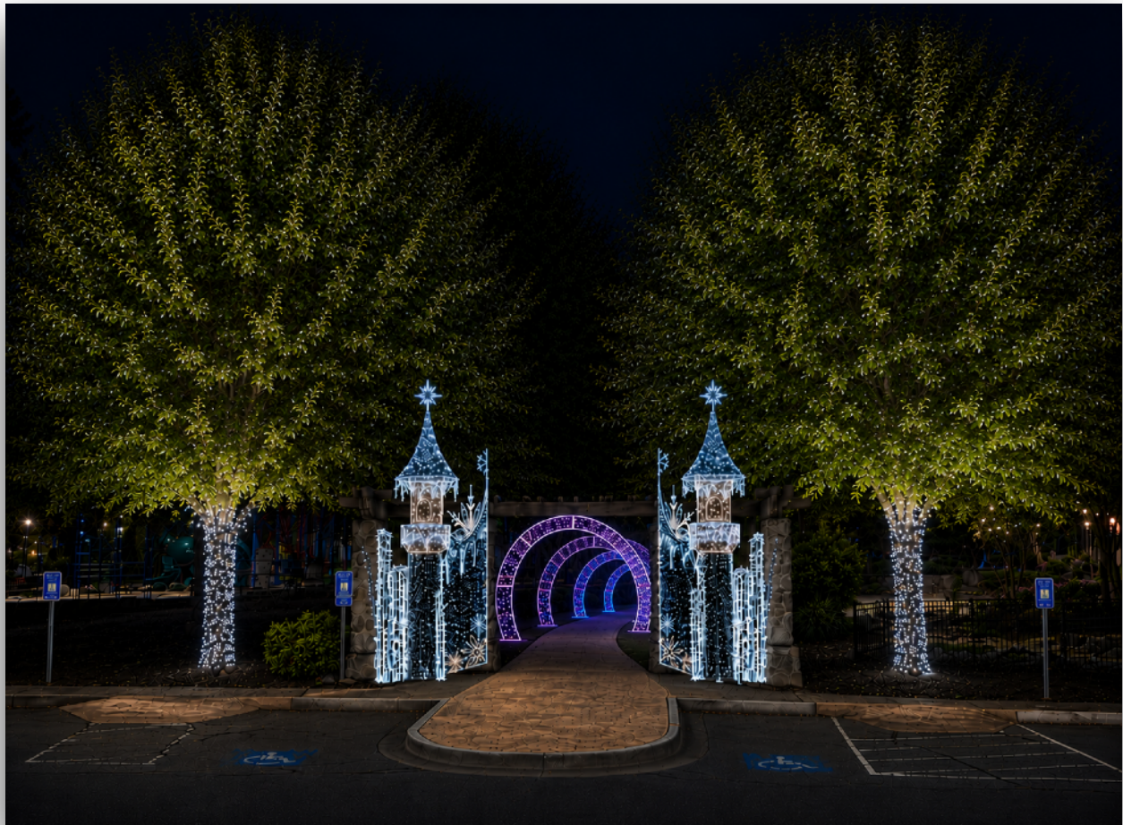
Main Playground Entrance Example

Passing through the castle gates, visitors will journey beneath a series of vibrant RGB illuminated arches that create a colorful tunnel of light leading into the playground. As the pathway gently curves, guests will be greeted by a striking 11-foot illuminated 3D star motif, serving as the first major focal point within the display.