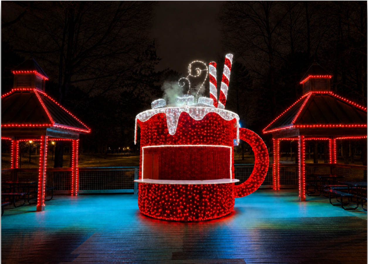
Example of Cocoa Mug

The surrounding deck pavilions will be outlined with festive lighting to frame the space and create a warm, welcoming atmosphere. Guests will be encouraged to step inside the giant mug for memorable photos. The combination of the oversized interactive centerpiece, festive pavilion lighting, and cozy gathering space will make this destination a favorite stop for families and visitors of all ages.