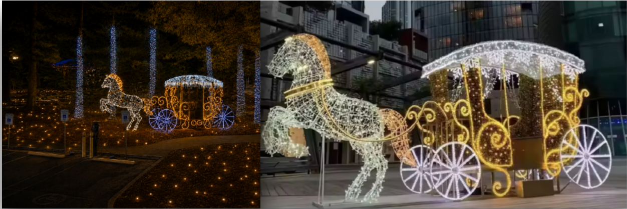
Horse and Carriage Set Piece