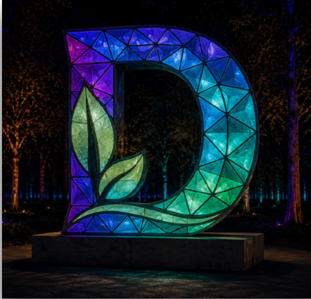
Example of Stain Glass Logo