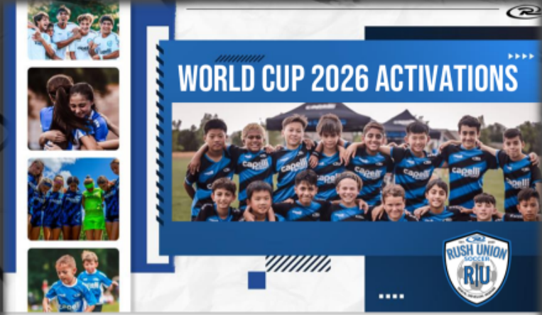
World Cup 2026 Activation